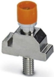
Slide, color: silver

Please be informed that the data shown in this PDF Document is generated from our Online Catalog. Please find the complete data in the user's documentation. Our General Terms of Use for Downloads are valid ( http://phoenixcontact.com/download )